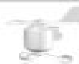
1 x sensor de viento (1 x vana arriba 1 x anemómetro abajo)