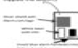
Top of Image Sensor Daughterboard