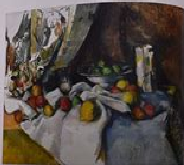
Paul Cézanne Fruit on a Table, 1895 Oil on canvas, 65 x 81 cm Musée d'Art Moderne, Paris