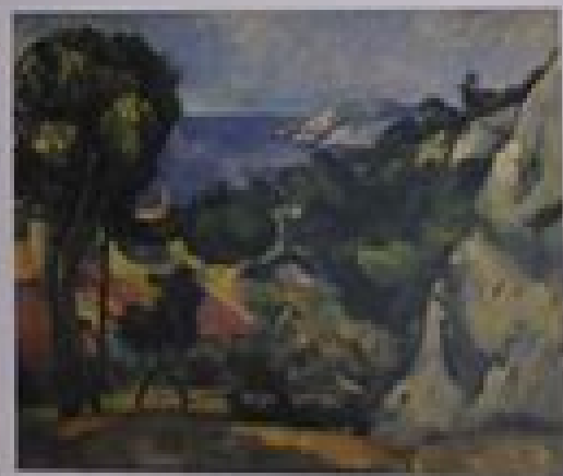
Paul Cézanne The Bay of Gordes, 1905 Oil on canvas, 65 x 81 cm Musée d'Art Moderne, Paris