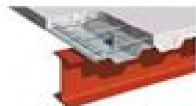
H/L Headed Concrete Anchors