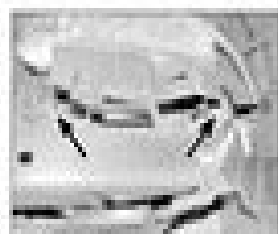
4.66 Wash the washer and remove the bumper plate bolts under each headlight (arrowed) ...