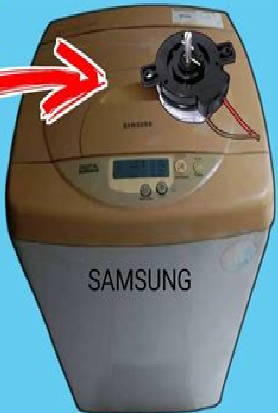
Diagram mesin cuci otomatis jadi manual