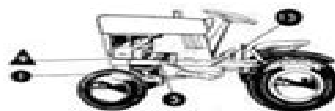
Left side view

▲ Oil with can ■ Change Oil ● Grease with low pressure or hand gun ● Check gear lube