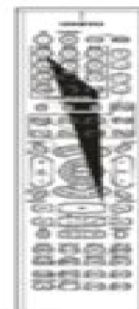
RC-860M or RC-891M