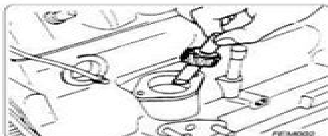
Removal of Distributor and Distributor Driving Spindle