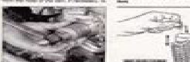
Fig. 6 The timing belt drive assembly is located at the front of the engine, behind the timing belt cover.