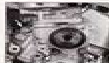
Fig. 1 The timing belt drive assembly is located at the front of the engine, behind the timing belt cover.