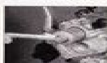
Fig. 3 The timing belt drive assembly is located at the front of the engine, behind the timing belt cover.