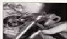
Fig. 2 The timing belt drive assembly is located at the front of the engine, behind the timing belt cover.