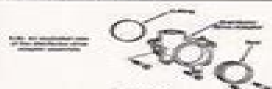
Fig. 4 The timing belt drive assembly is located at the front of the engine, behind the timing belt cover.