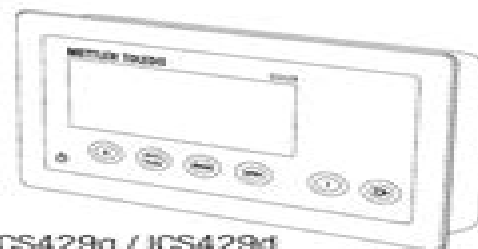
ICS429a / ICS429d