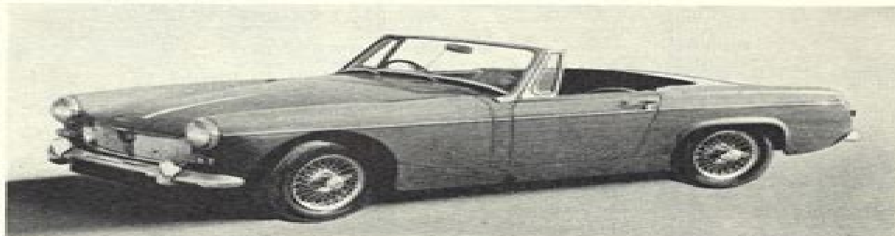
DISTINGUISHING FEATURES: Swivelling quarter lights and wind-up windows identify the Mark II cars in latest form, although styling in general follows the lines of previous models

All rights reserved. This Service Data Sheet is compiled by the technical staff of Motor Trader from information made available by the vehicle manufacturers and from our own experience. It is the copyright of this journal, and may not be reproduced, in whole or in part, without permission. While care is taken to ensure accuracy we do not accept responsibility for errors or omissions.