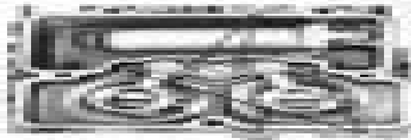
Figure 3. The building shown in the photograph is the main building of the school. The building is a large, multi-story structure with a complex roofline, featuring several gables and a central tower-like section. It appears to be made of brick or a similar masonry material. The photograph is taken from a low angle, looking up at the building, which emphasizes its height and scale. The building is surrounded by some trees and other vegetation, suggesting it is located in a landscaped area.