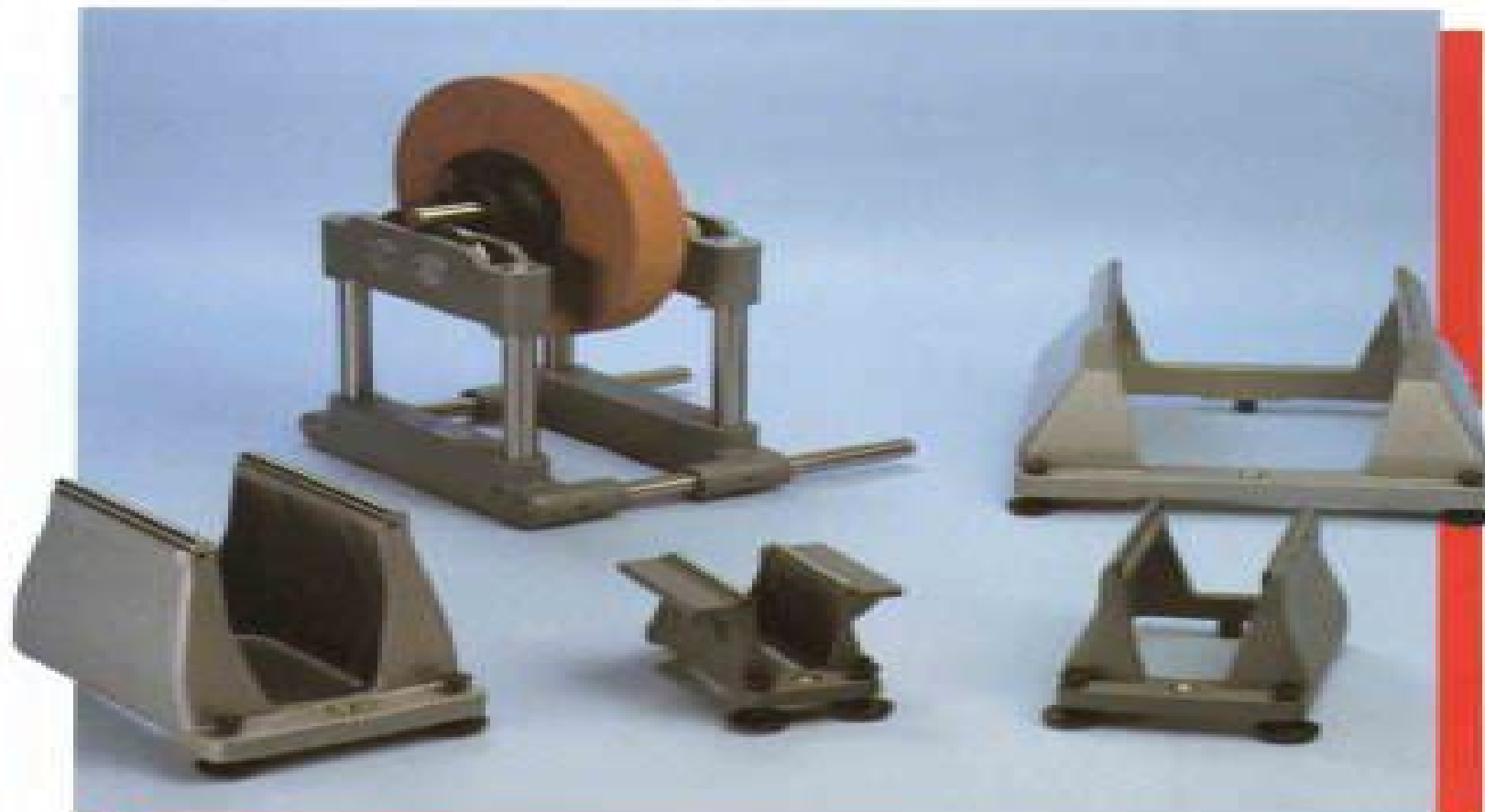
Static balancing arbors for disc wheels