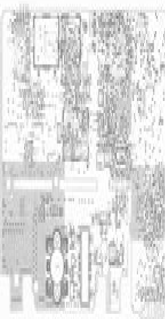
1st Floor Plan (Scale 1:500)