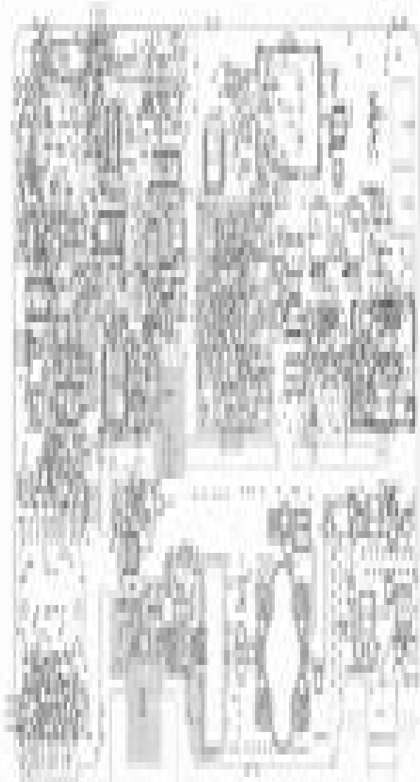
2nd Floor Plan (Scale 1:500)