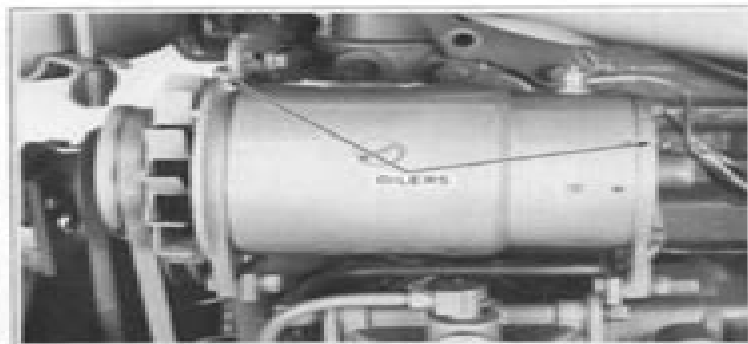
Figure A2-26 Generator Oilers

Check the manual steering gear lubricant level yearly or every 1000 hours of operation. (See Figure A2-24.) Maintain the grease level at the lower edge of the filler-test plug opening by adding No. 1 grade multi-purpose lithium or calcium base grease.