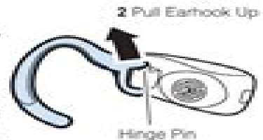
2 Pull Earhook Up