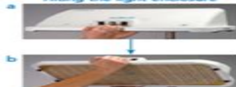
Tilting the light enclosure