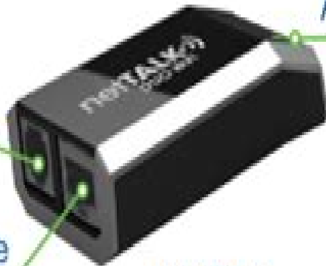
netTALK DUO WiFi