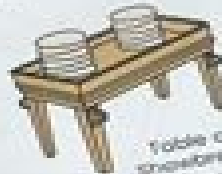
Table of Showbread