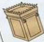
Altar of Incense