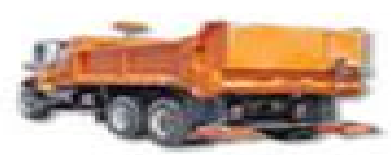
Spreader | Replacement Tailgate