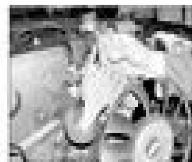
4.6i ... and remove the tensioner