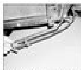
4.6b Connect the power steering fluid hose