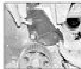
4.6m Remove the rear timing belt cover (tensioner codes A6P, A6M, A6N and A6J)

9b With technicians use a special tool which engages the belt hole in the tensioner wheel, tensioner 9b' works alone or a few other timing belt tools and a lever can be used. Turn the tensioner anti-clockwise as far as possible, then turn it slowly clockwise until the pointer is approximately 14.0 mm from the stationary mark. Continue to turn the tensioner until the two pointers are exactly opposite each other. Now tighten the nut to the specified torque (see illustration).