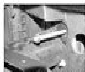
4.6a Tighten the power steering fluid nut supporting the bolt across