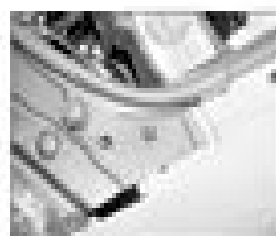
4.6e ... then remove the bolt each side of the top of the wing ...

into the underbody channels (see illustrations)