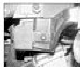
4.6f ... and the one diagonally each headlight

8 If the timing belt is to be refitted, mark its