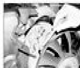
4.6h (Remove the bolts) ...