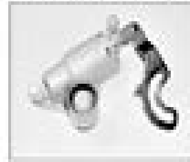
4.6o Timing belt tensioner engine codes A6P, A6M, A6N and A6J