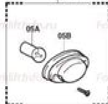
05(LPG, STEEL CABIN)