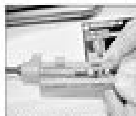
4.6g Separate the front section of the tensioner release cable