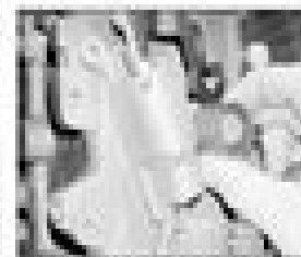
4.6n Remove the timing belt tensioner roller (engine codes A6P, A6M, A6N and A6J)