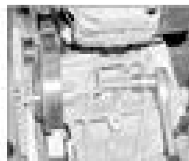
4.6j (Remove the bolt) ...