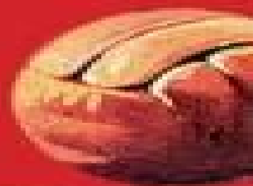
Illustration by [illegible]