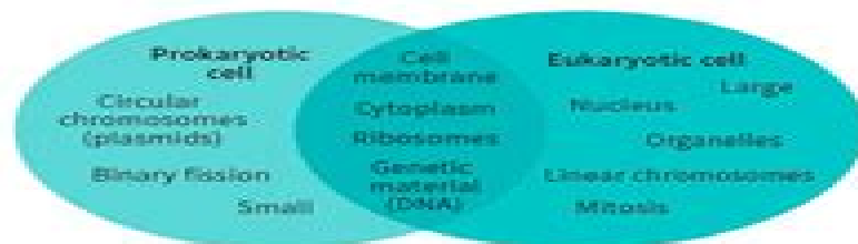
Figure 1.2 Venn diagram showing relationship between prokaryotic and eukaryotic cells