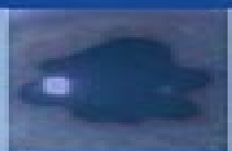
Uveitis and Immunological Disorders