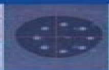
Cataract and Refractive Surgery