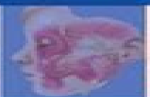
Oculoplastics and Orbit