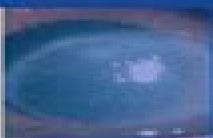
Cornea and External Eye Disease