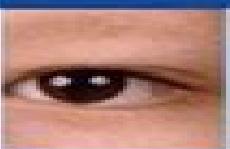
Pediatric Ophthalmology, Neuro- ophthalmology, Genetics