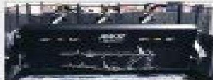
MULTIPLE ROBOT CONTROL