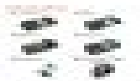
Figure 2: A flowchart illustrating the process of data collection and analysis, showing the flow from data sources to the final analysis results.

The second section of the document focuses on the challenges faced by organizations in implementing effective data management strategies. It highlights the need for robust security measures to protect sensitive information from unauthorized access and data breaches. The text also discusses the importance of data quality and the role of data governance in ensuring the integrity and reliability of the data used for decision-making.