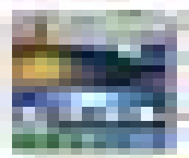
Figure 4: A screenshot of a data visualization tool showing a complex network of interconnected nodes and edges, representing a complex system or process.

The third section of the document explores the role of artificial intelligence (AI) in data analysis and decision-making. It discusses how AI algorithms can be used to identify patterns and trends in large datasets, enabling organizations to make more informed decisions. The text also addresses the ethical considerations surrounding the use of AI, such as the potential for bias and discrimination.