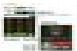
Figure 3: Two tablets displaying different data visualizations, illustrating the use of mobile devices in data analysis and reporting.

The second section of the document focuses on the challenges faced by organizations in implementing effective data management strategies. It highlights the need for robust security measures to protect sensitive information from unauthorized access and data breaches. The text also discusses the importance of data quality and the role of data governance in ensuring the integrity and reliability of the data used for decision-making.