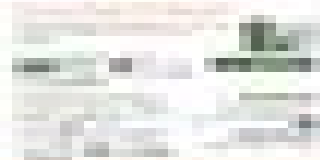
Figure 6: A flowchart illustrating the process of data collection and analysis, showing the flow from data sources to the final analysis results.

The fifth section of the document discusses the importance of data privacy and the need for organizations to implement strong data protection measures. It highlights the various regulations and standards that govern data privacy, such as the General Data Protection Regulation (GDPR) in the European Union, and the need for organizations to ensure compliance with these requirements.