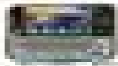
Figure 1: A screenshot of a data visualization tool showing a network of interconnected nodes and edges, representing a complex system or process.

The first section of the document discusses the importance of maintaining accurate records of all transactions. It emphasizes the need for transparency and accountability in financial reporting, particularly in the context of public sector organizations. The text outlines the various methods used to collect and analyze data, ensuring that the information is reliable and up-to-date.