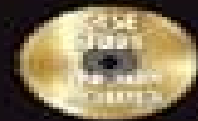
Image shown is of the core product; image of product received may appear differently.