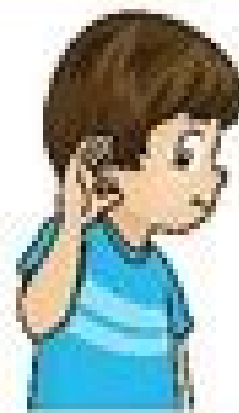
listening to others