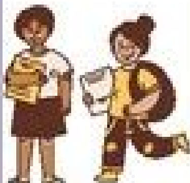
going to school