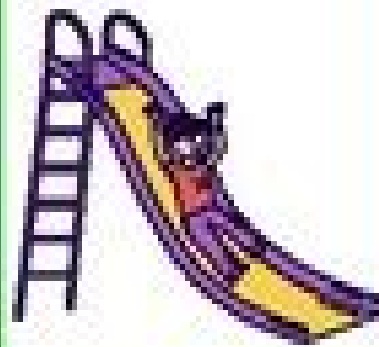
playing on the playground