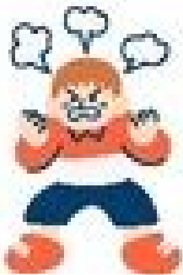
managing big emotions