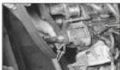
10.8a When removing the timing belt on models with a two-piece crankshaft hub, it's a tight fit to remove it around the hub, but it's a lot easier than removing the crankshaft hub assembly, which is secured by a very tight bolt.

alignment mark on the camshaft sprocket and use timing-cover to ensure correct refitting.