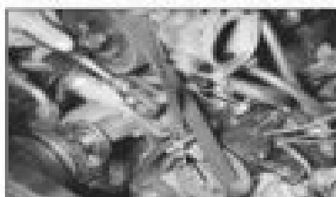
10.8 Loosen the idler pulley bolts (arrowed) to relieve the tension on the timing belt so it can be removed.