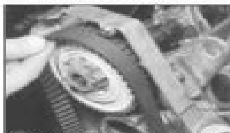
10.9b Removing the timing belt from the camshaft sprocket on the M40 engine.