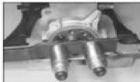
10.12a Home-made tool for holding the crankshaft stationary while the crankshaft pulley bolt is being loosened (engine removed for clarity).

Note: The removal of the crankshaft bolt means that the crankshaft is no longer clamped to the engine block. To prevent the crankshaft from rotating, use a bolt (numbered 112110 (M20 engines) or 112110 (M40 engines) for this purpose. If this tool cannot be bought or borrowed, check with a tool-shed or motor factors for a tool capable of doing the job. Note that the tool number 112110 bolts on the rear of the cylinder head and engages with the flywheel ring gear, so it will only be possible to use this tool if the gearbox has been removed, or if the engine is out of the vehicle (see illustrations). On