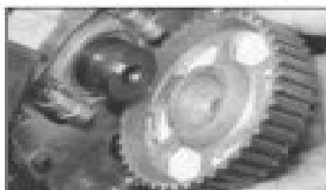
10.10 Removing the camshaft sprocket on the M40 engine.