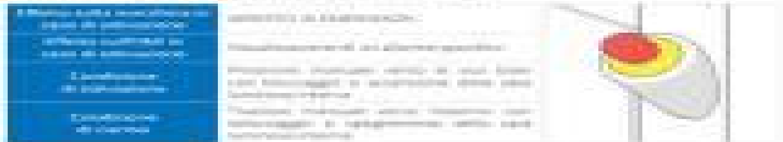
FIGURA 1.11.1. PROTEZIONE DEI PERSONE DA INCENDIO EDA

La protezione di un edificio da incendio è un processo complesso che coinvolge molti fattori, tra cui la progettazione, la costruzione, l'uso e la manutenzione dell'edificio.