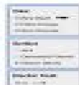
Figure 3: Finding the Radius of a Sphere

Now, let's use the sphere model to find the distance from the center of the sphere to the dot. We will use the radius of the sphere to find the distance.