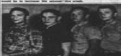
Members of the Brownwood Chamber of Commerce are pictured at a luncheon held in honor of the city's centennial.

The board's actions were also seen as a signal that the economy was beginning to show signs of improvement.