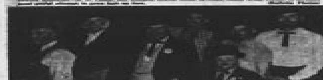
Members of the Brownwood Chamber of Commerce are pictured at a luncheon held in honor of the city's centennial.

The storm, which was a combination of a tropical storm and a cold front, brought heavy rain and strong winds to the state.