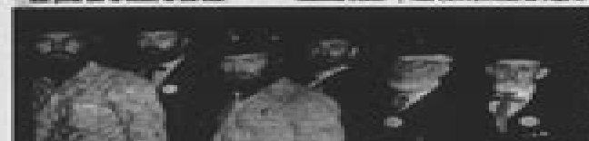
Members of the Brownwood Chamber of Commerce are pictured at a luncheon held in honor of the city's centennial.

The committee has been successful in securing the cooperation of many local organizations and businesses.