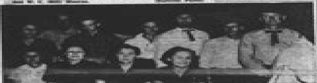
Members of the Brownwood Chamber of Commerce are pictured at a luncheon held in honor of the city's centennial.

President Eisenhower said in his veto message that the bill was "not in the best interests of the American people."