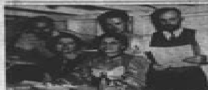
Students at the Brownwood Public Library are looking at books in the new children's section.