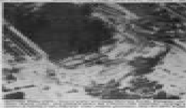
Wreckage of Navy F-4 Phantom II fighter jet is carried aboard the USS Intrepid (DD-802).

The Navy said today that the wreckage of the F-4 Phantom II fighter jet was carried aboard the USS Intrepid (DD-802) and is being held in a secure location.