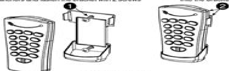
Figure 2 - Mounting