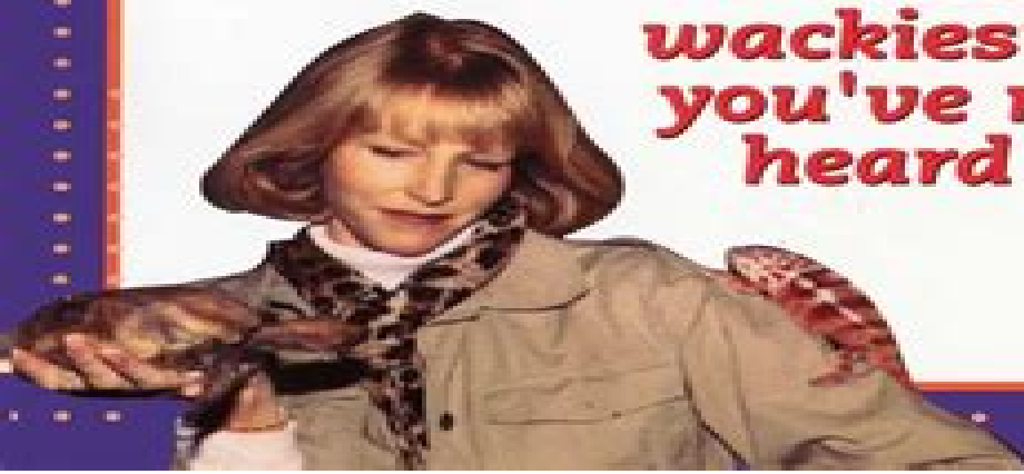
BUG WRANGLER AND ANIMAL HANDLER