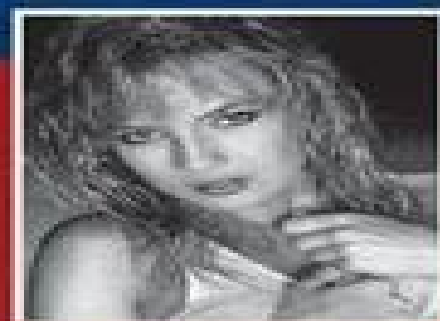
TRACI LORDS REVEALS— "I'M YOUNGER THAN I LOOK."

CHARLIE MANSON HEADS TO THE WEST COAST, GETS IN TROUBLE