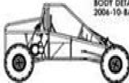
BODY DETAILS 2006-10-BAL-001-01 TO 04