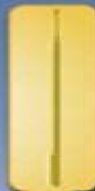
Drive & control system