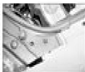
4.68 Then remove the bolt each side at the top of the wing ...

into the underbody channels (see illustrations)