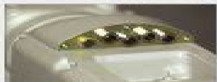
UPPER ARM CONNECTORS