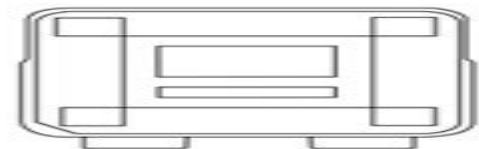
Charging Pad with Identification Code