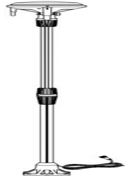
RTK Base Station Holder