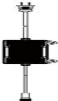
Charger for charging station