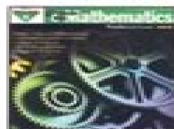
Grade 6 • NL1309