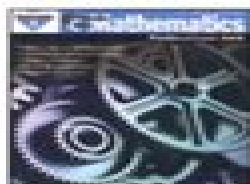
Grade 5 • NL1308