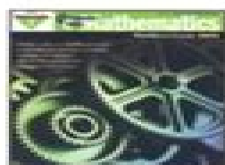
Grade 1 • NL1304