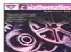
Grade 2 • NL1305