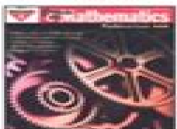
Grade 4 • NL1307