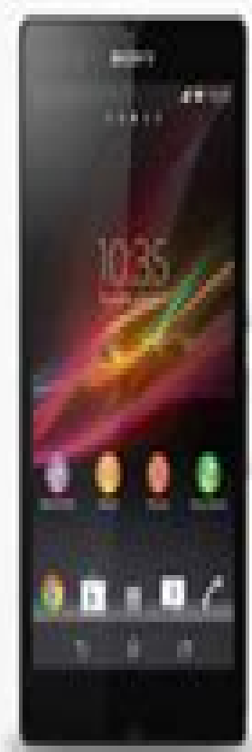
Sony Xperia Z