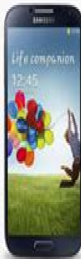
Samsung Galaxy S4