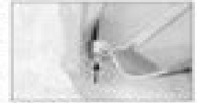
2-14: Radiator assembly (from front view of the radiator)