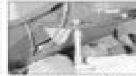
2-13: Radiator assembly (from side view of the radiator)