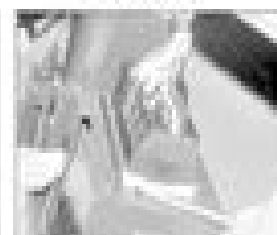
4.6d ... undo the heater retaining screws using sockets from the panel ...