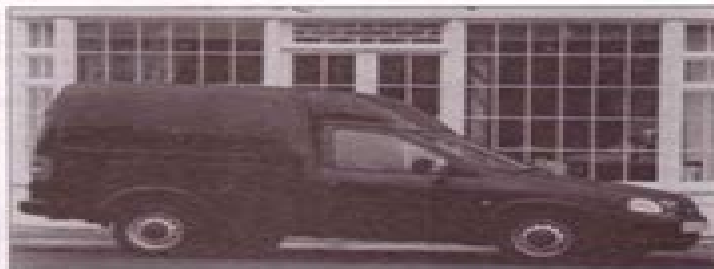
Vauxhall Combo Van

The original Corsa models were first introduced to the European market in Spring 1993 and are covered in the companion publication to this manual - SRM 1985. The models covered in this publication are the April 1997 onward models, which were the subject of a model facelift together with extensive mechanical revisions. This manual covers models fitted with petrol engines, but other models in the range are available with diesel engines.