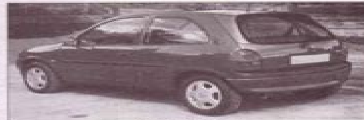
Vauxhall Corsa 16V