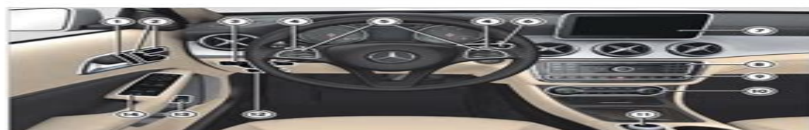
Cockpit – overview